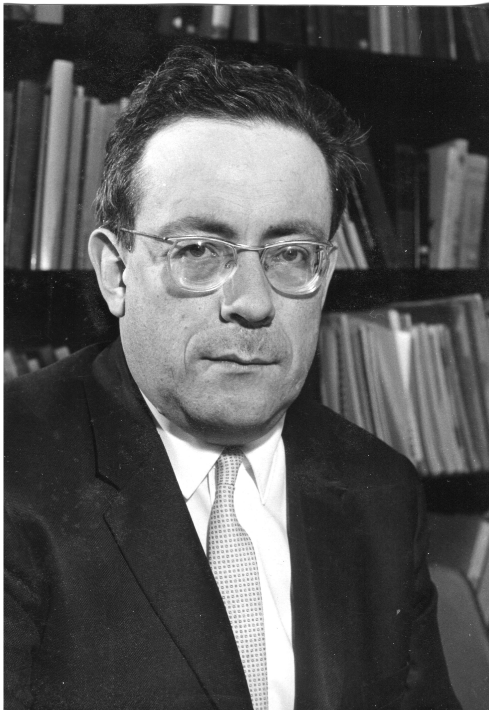
Louis Michel, professor at the IHES.