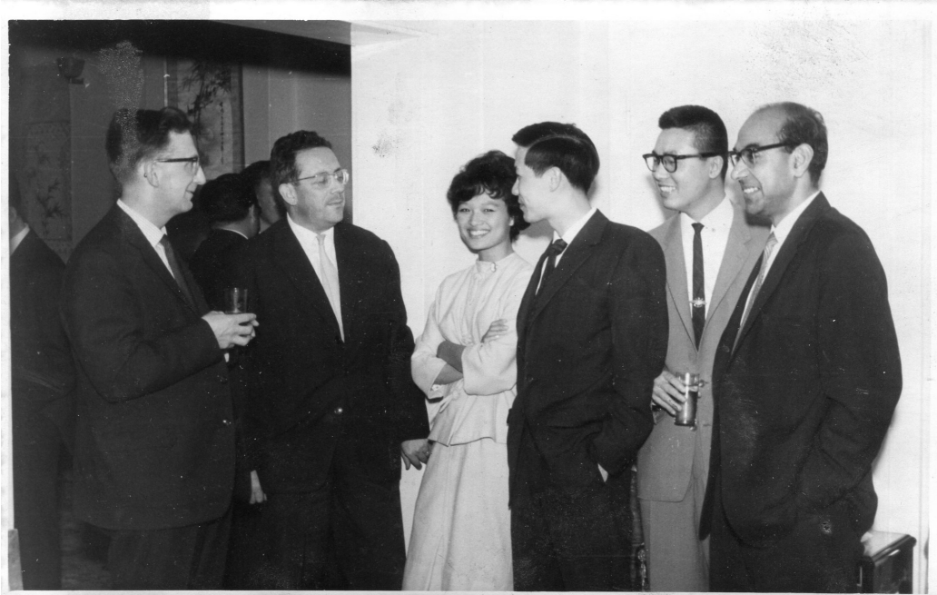
Louis Michel in the embassy of China in Ankara, 1963.