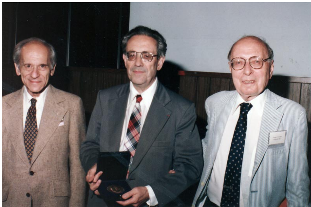
The 1984 Wigner medal ceremony honoring LOUIS MICHEL. On the left : V. Bargmann. On the right : E.P. Wigner.